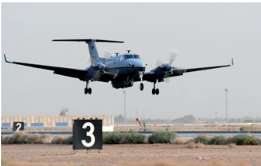
An MC-12W (modified King Air 350) lands after its first mission at Balad, Iraq.

No matter what type of aircraft, CAT has the specialists you need to talk to when making this choice. Contact us today to discuss this exciting decision that can save you time and money.