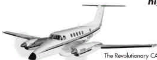
The Revolutionary CATPASS 250

What better way to gain the advantages of a high-flotation gear system at a fraction of the cost?